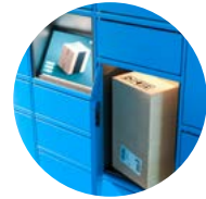
Last Mile Delivery