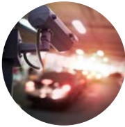
ANPR / CCTV

Applications that need the rapid deployment benefits of LTE as a primary or secondary failover solution include: